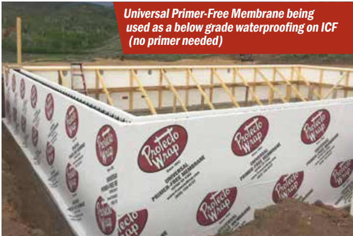
Universal Primer-Free Membrane being used as a below grade waterproofing on ICF (no primer needed)