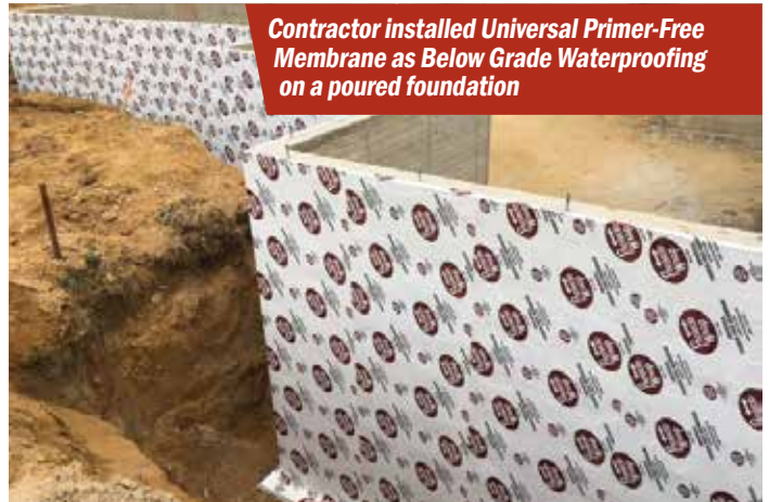
Contractor installed Universal Primer-Free Membrane as Below Grade Waterproofing on a poured foundation