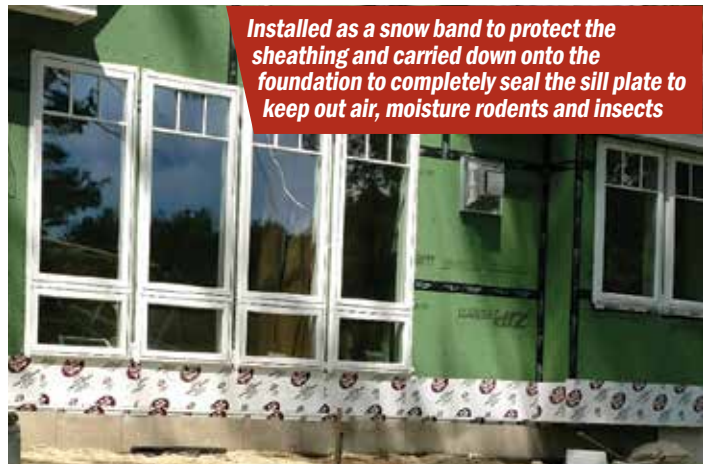
Installed as a snow band to protect the sheathing and carried down onto the foundation to completely seal the sill plate to keep out air, moisture rodents and insects

NOTE: For the most current information, refer to the Protecto Wrap website at www.protectowrap.com .