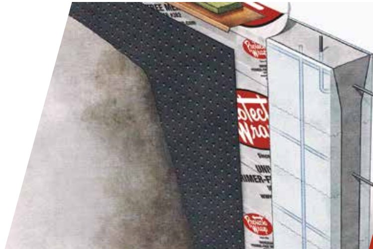
Below Grade on ICF

NEW! INSTALL DOWN TO -20°F (-28°C) WITHOUT THE NEED FOR A PRIMER